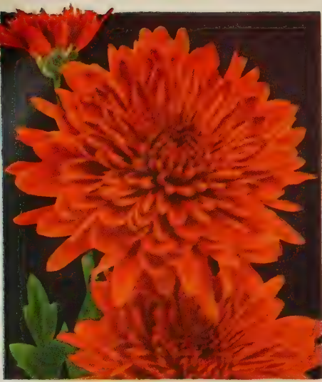
CYDONIA. 50c each; 3 for $1.25

8 BOUQUET Mums A gorgeous selection of long-stemmed kinds for cutting. 8 Sure-to-Bloom Plants $4.50 (1 of each pictured)